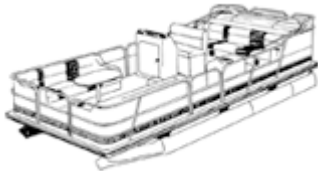
PLEASE MARK EXISTING DAMAGE

No damage _____ Please describe damage: _____